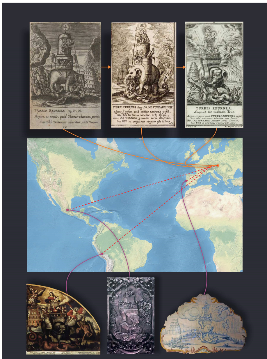
Fig. 1: Conceptual scheme showing one emblem ( Turrus Eburnea ), its cultural transmission and remediation (i.e. its transition from print to other supports: painting, sculpture and tile painting).